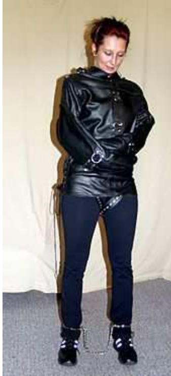
A woman wearing a leather straitjacket with leg irons

Some jackets intended for fetish use include additional restraining features like wrist straps, lockable fastenings or opt to cross the arms behind the back. Again, these should be used cautiously and never for long periods, as they can interfere with circulation or make the jacket difficult to release in the event of emergency.